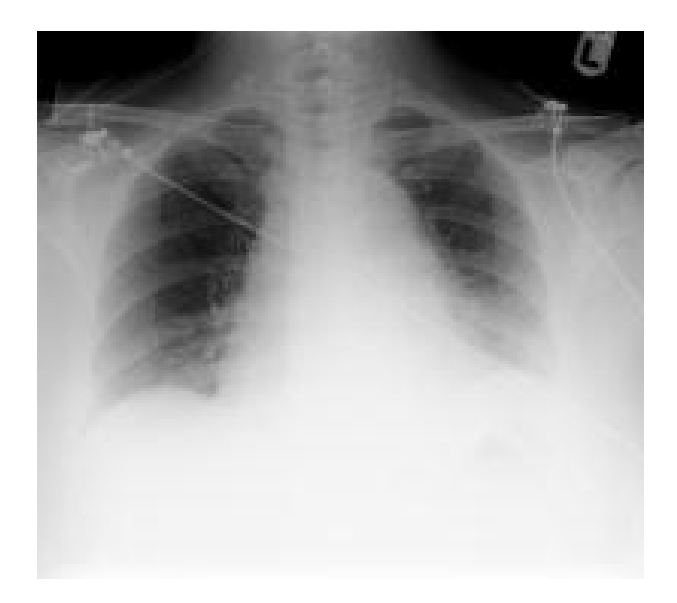
Fig. 1. Primary survey chest radiograph.

An associated mediastinal hematoma was noted, with no evidence of any other intraperitoneal injury (Fig. 2).