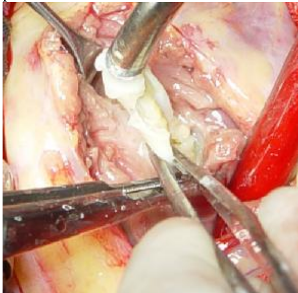
Fig. 3. View of open heart surgery of the second patient.

septum, suggestive of a hydatid cyst. The cyst was removed surgically (Figs. 3, 4). The patient developed complete heart block after surgery, which was managed by an epicardial pacemaker.