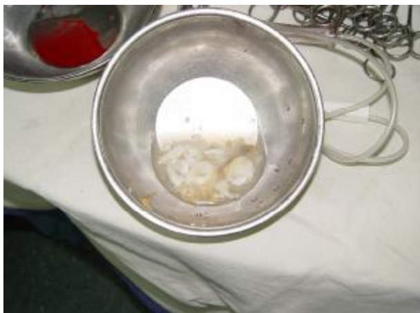
Fig. 4. Hydatid cysts removed from the second patient.

Patient 3 A 15-year-old girl was admitted to our hospital complaining of palpitation and easy fatigability upon effort for the past year. Her symptoms were exacerbated after a running race. Physical examination revealed an apical pansystolic murmur. Echocardiography showed a large cyst (48 x 29 mm) in the free wall of the left ventricle posteriorly, in the left ventricular cavity.