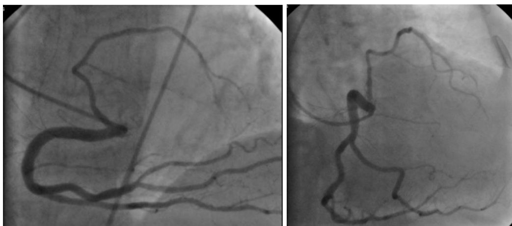
Figure 2. A normal right coronary artery and another vessel arising from the origin of the right coronary artery, initially turning toward the left and then downward to the mid and distal parts of the anterior interventricular groove and giving rise to multiple small septal branches.

to the left, moved sharply downward to pass over the mid and distal parts of the anterior interventricular groove, and gave rise to multiple small septal branches (Fig. 2).