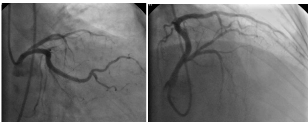
Figure 1. A short left anterior descending artery, originating from the left main and terminating immediately at the initial part of the anterior interventricular groove after giving off the first septal and diagonal branches.

media into the LCA manifested a normal left main and left circumflex artery (LCx). The LCx delivered 2 obtuse marginal branches, neither of which had significant narrowing. A short LAD arose from the left main, ran normally, and terminated immediately at the initial part of the anterior interventricular groove after giving off the first septal and diagonal branches. The area that is normally perfused by the mid and distal sections of the LAD had no vessels including the collateral circulation. This short LAD was meanwhile free of considerable narrowing (Fig. 1).